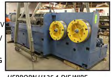
HERBORN H125 4-DIE WIRE DRAWING MACHINE

*Auction sale will be conducted in US Funds (USD)