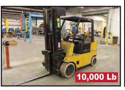
HYSTER S100E 10,000 LB LP FORKLIFT